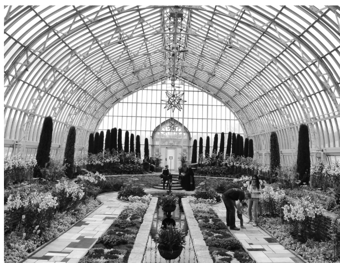
Above: Everyone's favorite room at the Como Conservatory.