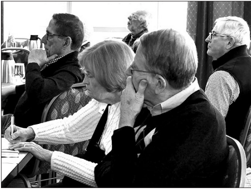
Audience contemplated workshop discussions.

journeys into retirement and any major transitions that may have led them to reassess what gives them a sense of meaning and purpose in