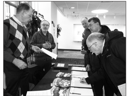
Employees attending OHR pre-retirement seminars signed up to receive UMRA's Retirement Information Kit.

Changes in the website have been made and the UMRA brochure has been reprinted to reflect this new approach to recruitment. Also, a supply of brochures has been delivered to OHR so that counselors