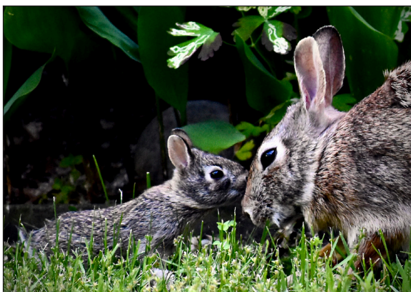
“I’ve got a secret.”