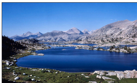
Marie Lake lies along the John Muir Trail in the southern Sierra Nevada in California.