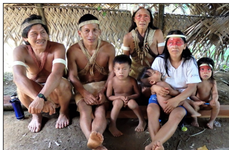
A Huaorani family in Ecuador.