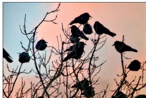
Crow roost.