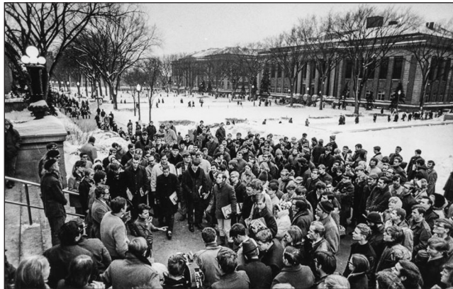
The student occupation of Morrill Hall in 1969 led to the creation of a series of new academic programs, including the Department of African American & African Studies, one of the first in the U.S.

But over the next eight months, the task force worked in the labyrinthine, serpentine ways that Universities do. And when we again met with the administration in January of '69, it was clear that little progress of any substantive, satisfactory sort had been made. That's when we decided that we had no alternative but to employ non-violent direct action in the spirit of Dr. King and take over the administration building, which we did in mid-January of '69. Looking back now, after over half a century, that event helped transform social and academic life at the University in a variety of ways.