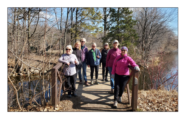
Members of the UMRA Hiking Club were happy to embrace spring (finally!) on their hike through North Oaks in early April.