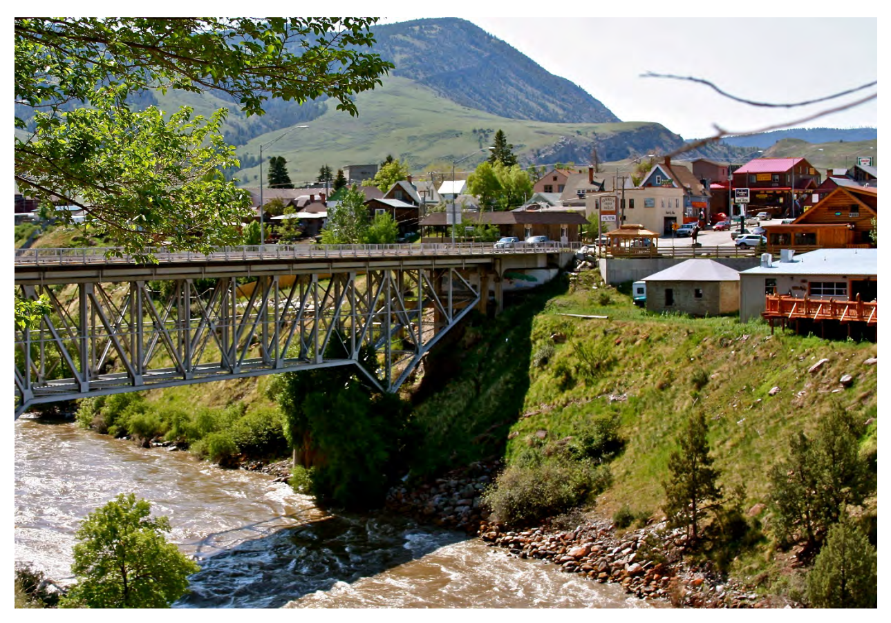
The Gardiner bridge Our house was on the left of the bridge

Down the hill and across the vacant lot, we could continue to the edge of the river gorge. From there we could go over the edge and make our way down to the river. Maybe inspired by our culvert-crawling, some of us decided that it would be fun to dig our own secret cave into the side of the gorge a few feet below the edge. We brought shovels and worked hard for several days. We dug a tunnel about eight feet in and then hollowed out a space big enough to sit in. We brought in little candles and had a hidden clubhouse where we could plot who knows what adventures. The cave kept us entertained for several days.