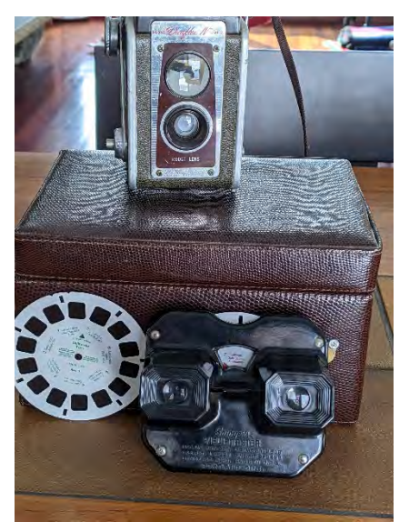
My View Master and camera

I remember the day in the summer of 1956 when I saw some cars that were absolutely unlike any I had ever seen before. They were huge and low with swept-back windshields and giant tailfins. About four of them came to Gardiner and parked for a while at a gas station. When I saw them, I immediately rushed home and got my camera to take pictures. My camera was an inexpensive Kodak Brownie using 620 film, but it was a double lens reflex design, just like the expensive Rolleiflex cameras that professional photographers often used. I burned up a roll of film (8 or 12 pictures) on those cars. It turned out they were slightly disguised versions of the new 1957 cars from Chrysler Corp, in the area for high-altitude testing. I was thrilled at the sneak preview!