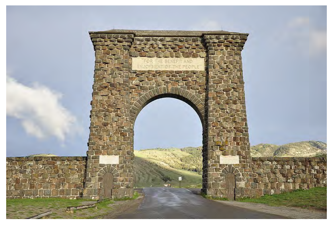
The Roosevelt Arch at the North Entrance to Yellowstone Park in Gardiner MT