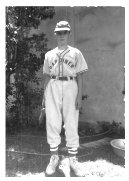
Me in my uniform

We played our home games on the big dirt field in front of the school—no grass and no fence in the outfield. The lack of a fence meant that if you hit a ball past both the infielders and the outfielders it could roll for a long way. This was especially so, along the third base line, since there was a road right next to it. A ball over the bag and past the third baseman could really roll. I was the team's third baseman, so it was my job to make sure that didn't happen. By and large, I was pretty good at it. I didn't let many balls get by me. The throw over to first from third is a long one, and I didn't have that great an arm, but I made up for it with my ability to get in front of the ball and get it out of my glove in a hurry.