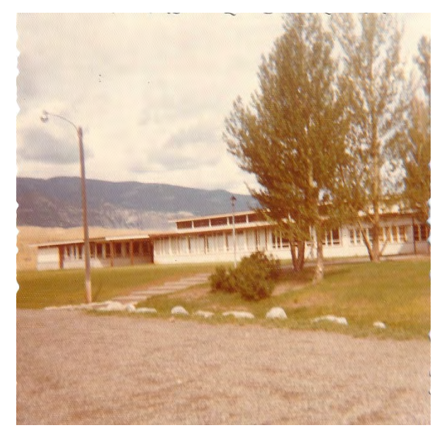
The Gardiner School

Since my father was the head of the school, and my mother was a teacher, I was a kid who had to be on my best behavior. If I acted up, even just a bit, I would be in big trouble. Fortunately, I wasn't the type who would act up anyway, and I didn't give in to occasional dares from the other kids. I was pretty much in the mold of a stereotypical second child, fairly conventional and wanting to get along with people.