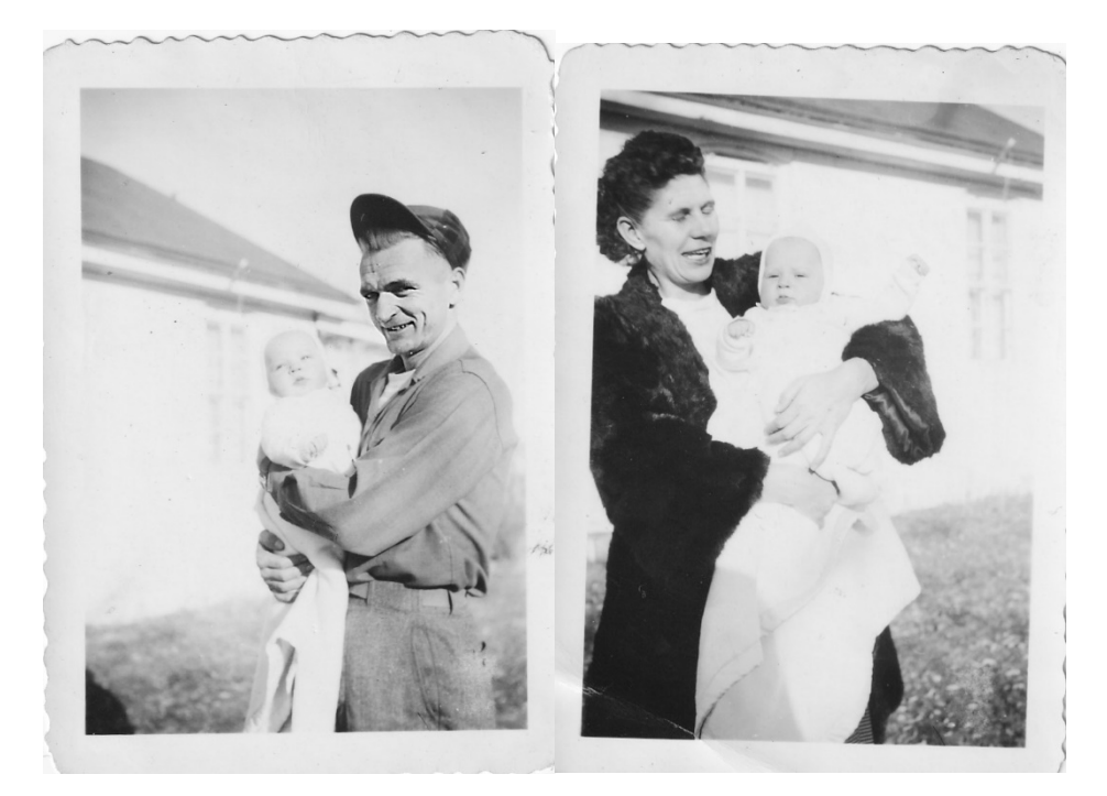
My Dad and Mom holding a newborn me