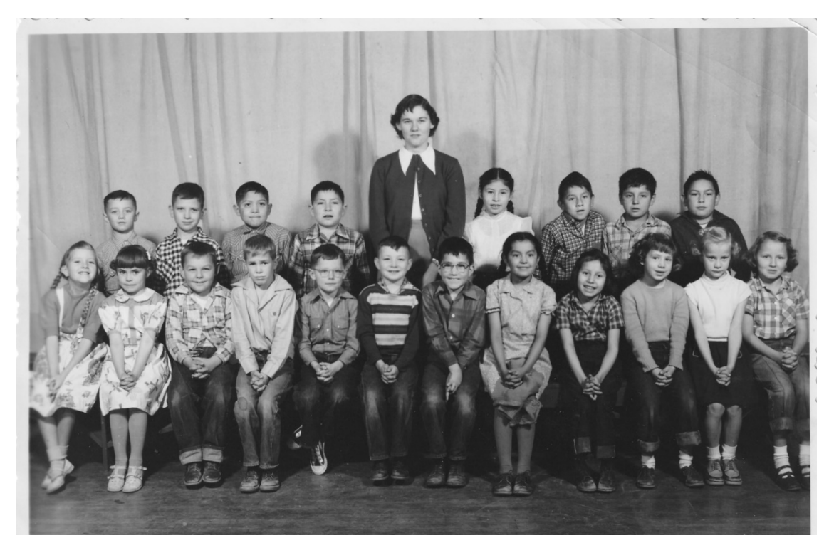
My first-grade class. I'm 2nd from the left

My father was the superintendent of the school there, and my mother taught one of the elementary grades. Many of my classmates were Native.