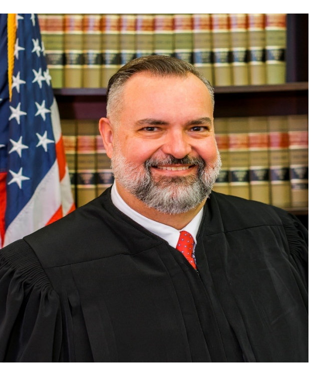
Judge Learned Hand