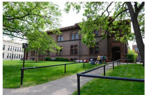
Shevlin Hall, Location of the Speech Language Hearing Sciences Lab