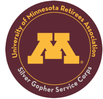
Figure 1: Silver Gopher Service Corp T-shirt Logo

Volunteer service and community are vital to the success and operation of UMRA and URVC and it is our mission to provide support and bridge communities. Our UMRA members have frequently expressed interest in teaming up with colleagues on volunteer activities, and in response, the Silver Gopher Service Corps was launched in April of 2023.