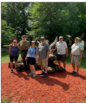
Members of the UMRA Hiking Club enjoyed a sunny, mid-July morning hike along Minnehaha Creek in Minneapolis.