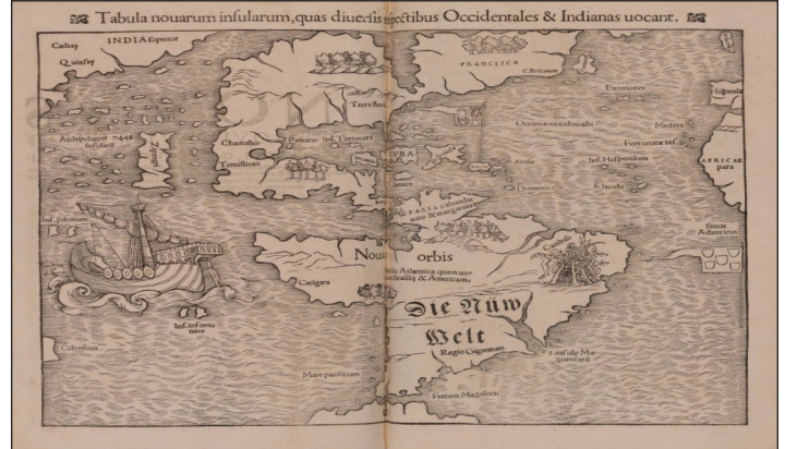
1550 map of the Americas.